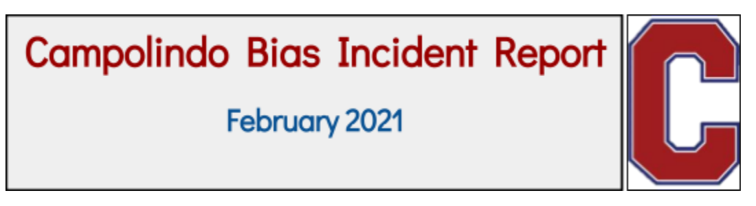
Campolindo strives to inspire and empower every student by fostering belonging, well-being and accountability in an equitable learning environment.